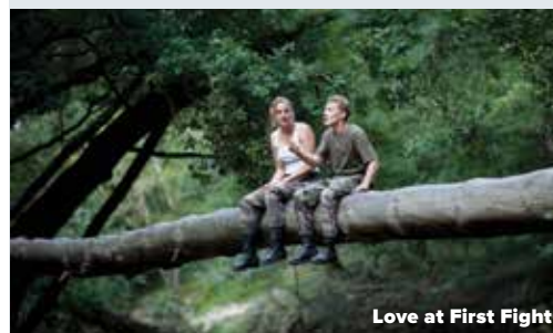
Love at First Fight

Cédric Anger, France, 2014, DCP, 111m A notorious serial killer is also a gendarme tasked with his own apprehension in this darkly ironic thriller from former Cahiers du Cinéma critic Cédric Anger, based on a true story. 📅 Tuesday, March 10, 6:45pm (Q&A with Cédric Anger and actor Guillaume Canet) Wednesday, March 11, 4:15pm