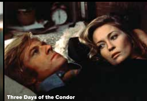
Three Days of the Condor