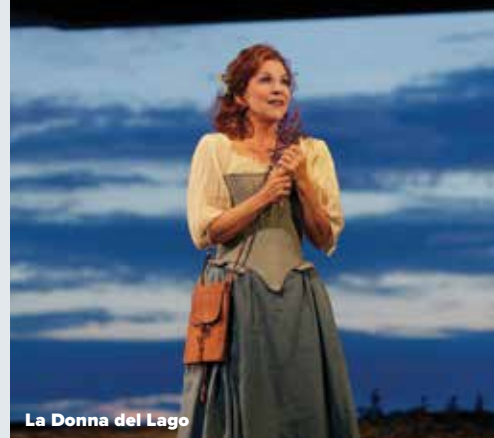
La Donna del Lago

Experience the thrill of the Metropolitan Opera's 2014–2015 season live on the big screen!