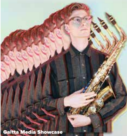
Galtta Media Showcase

An exciting monthly series that pairs intimate concerts with boundary-pushing video work.