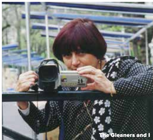
The Gleaners and I