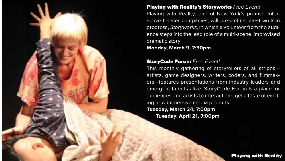
Playing with Reality