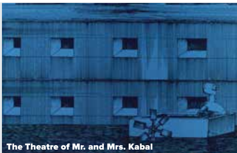
The Theatre of Mr. and Mrs. Kabal