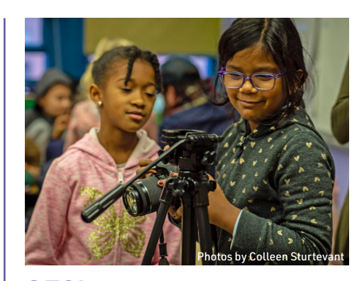
97% of students self-reported knowing how to use filmmaking language such as: "Action," "Rolling," "Cut," and "Quiet on Set."